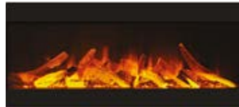
1250 | Halo, E-series, E-lectra and Volante