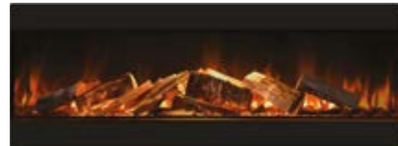
1500 | Halo, E-series, E-lectra and Volante