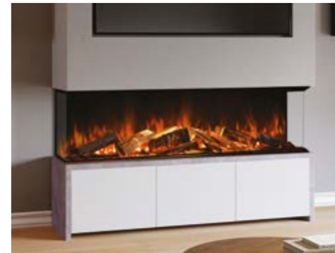
GF3 - three-sided