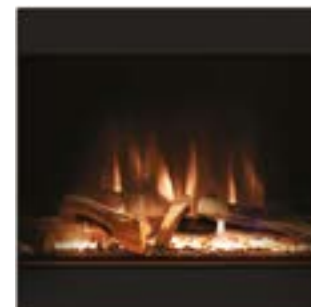
800 | Halo, E-series, E-lectra and Volante