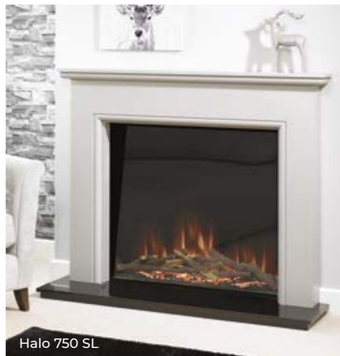
Halo 750 SL