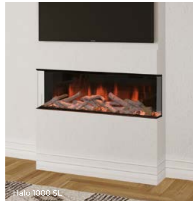
Halo 1000 SL