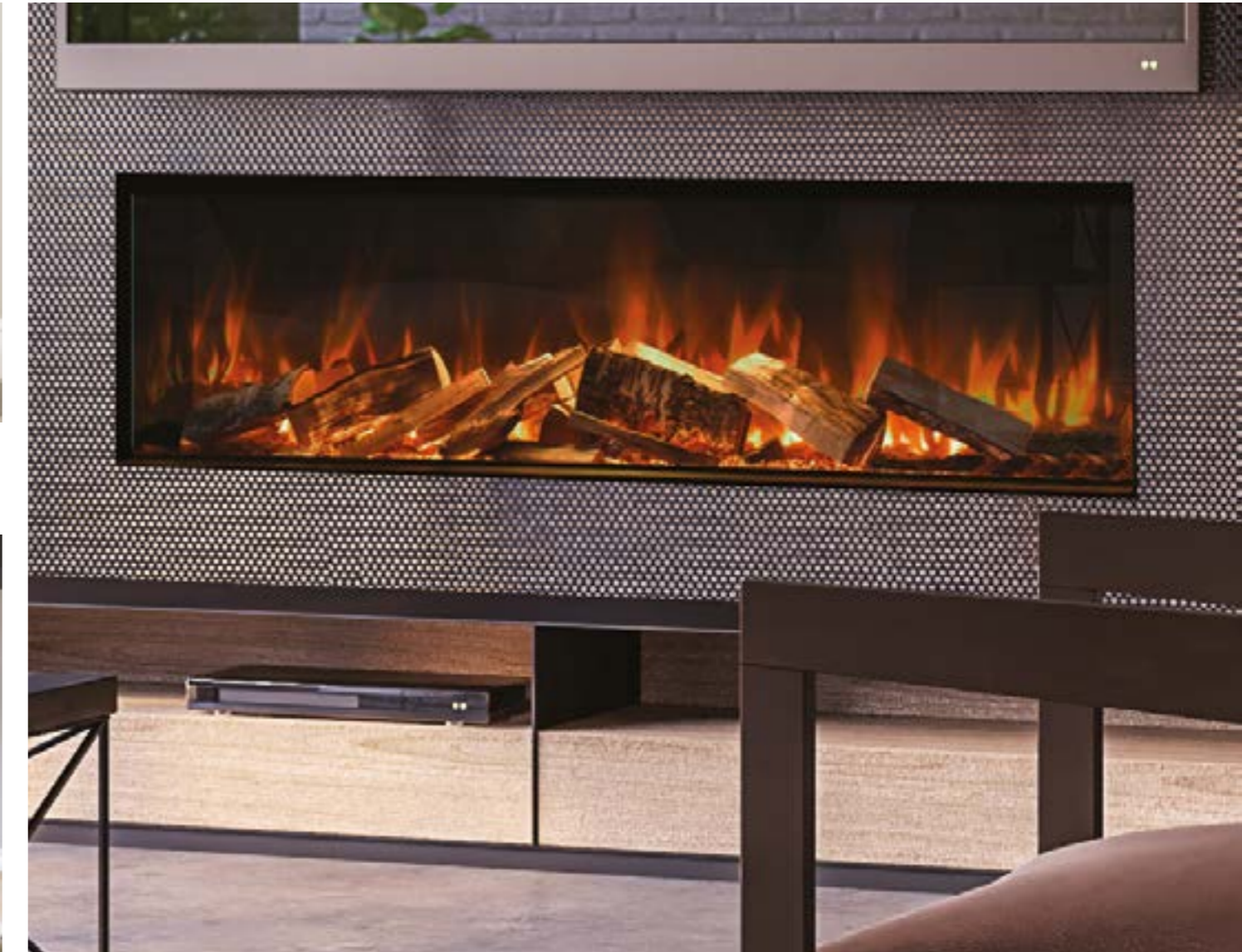
GF - one-sided