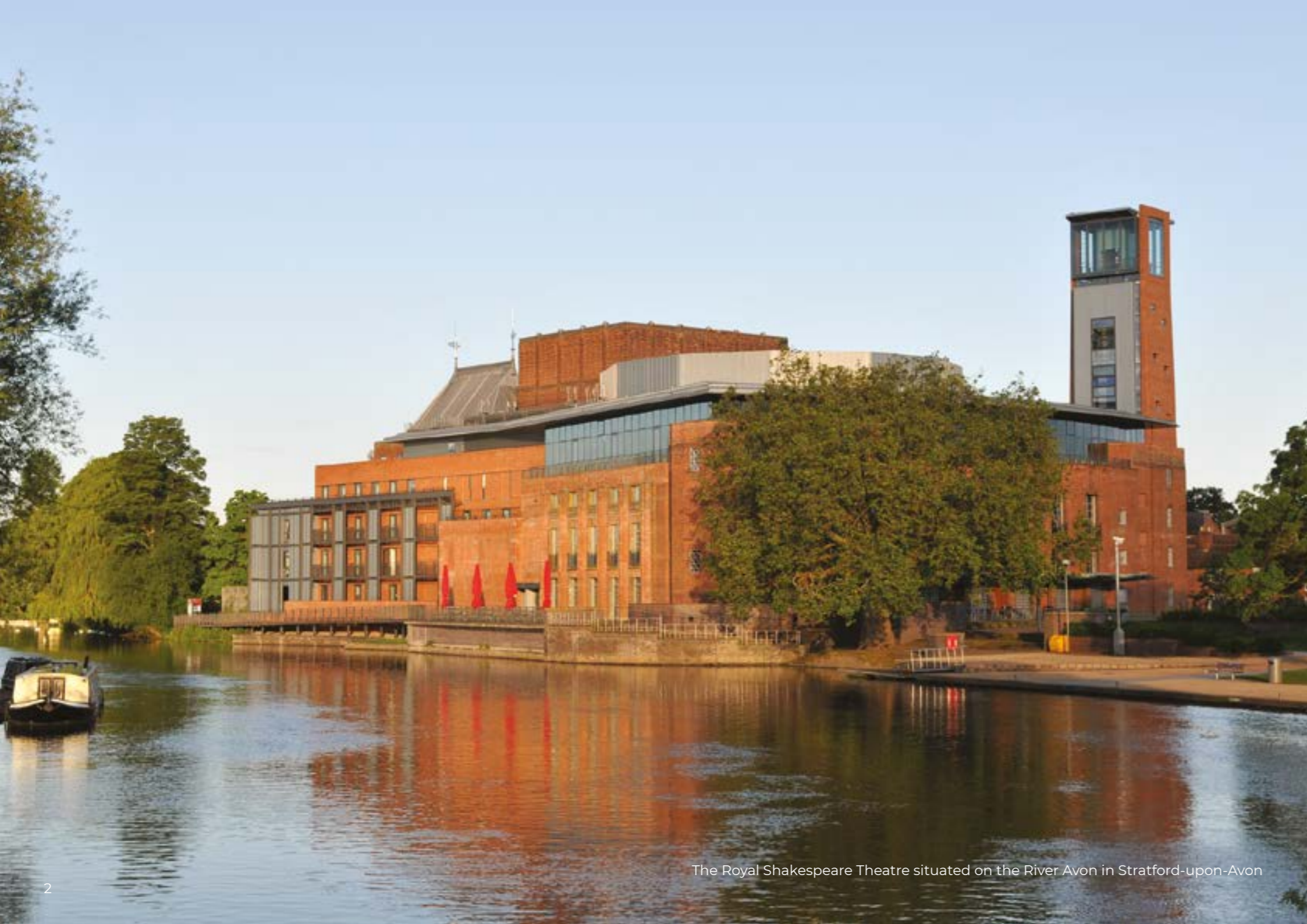
The Royal Shakespeare Theatre situated on the River Avon in Stratford-upon-Avon