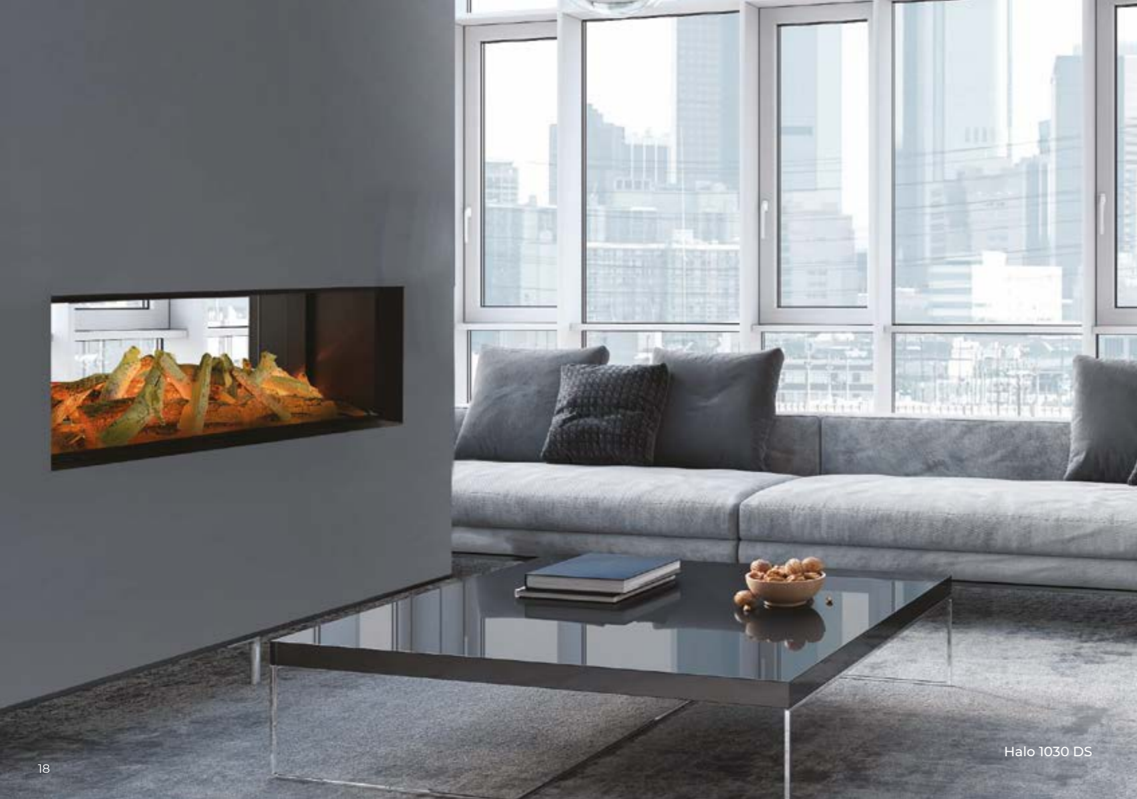
Halo 1030 DS