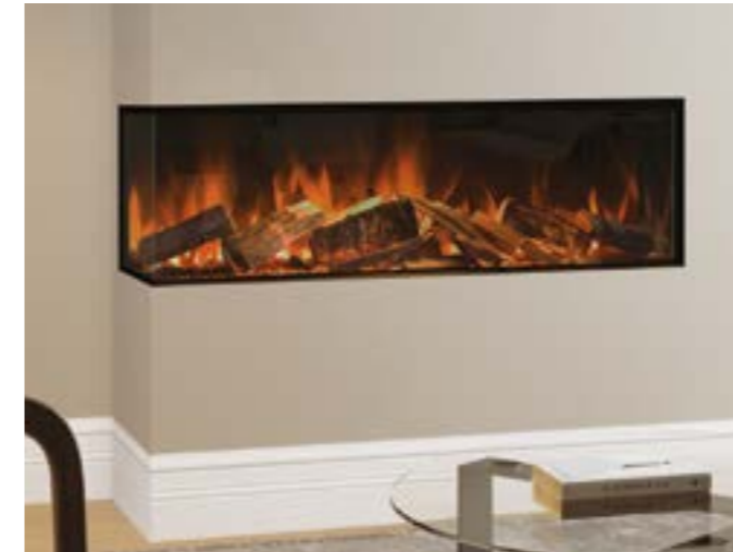
GF2 - two-sided