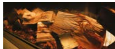
British woodland real logs

See page 40 for measurements and fire size chart