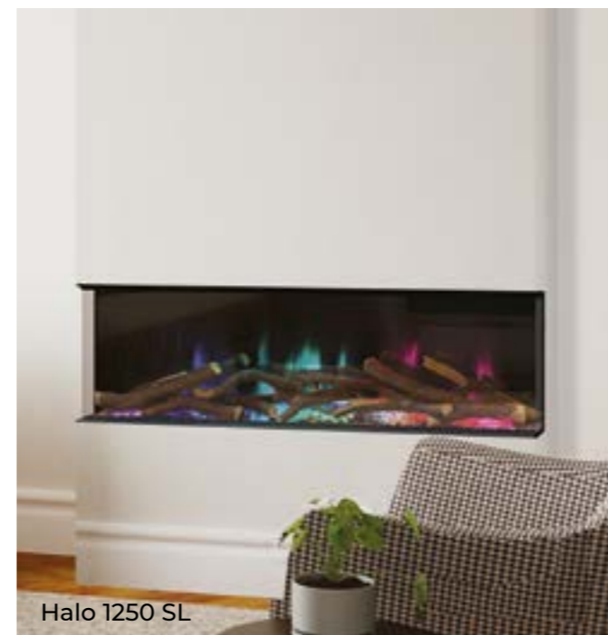
Halo 1250 SL