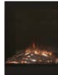
650 | Halo