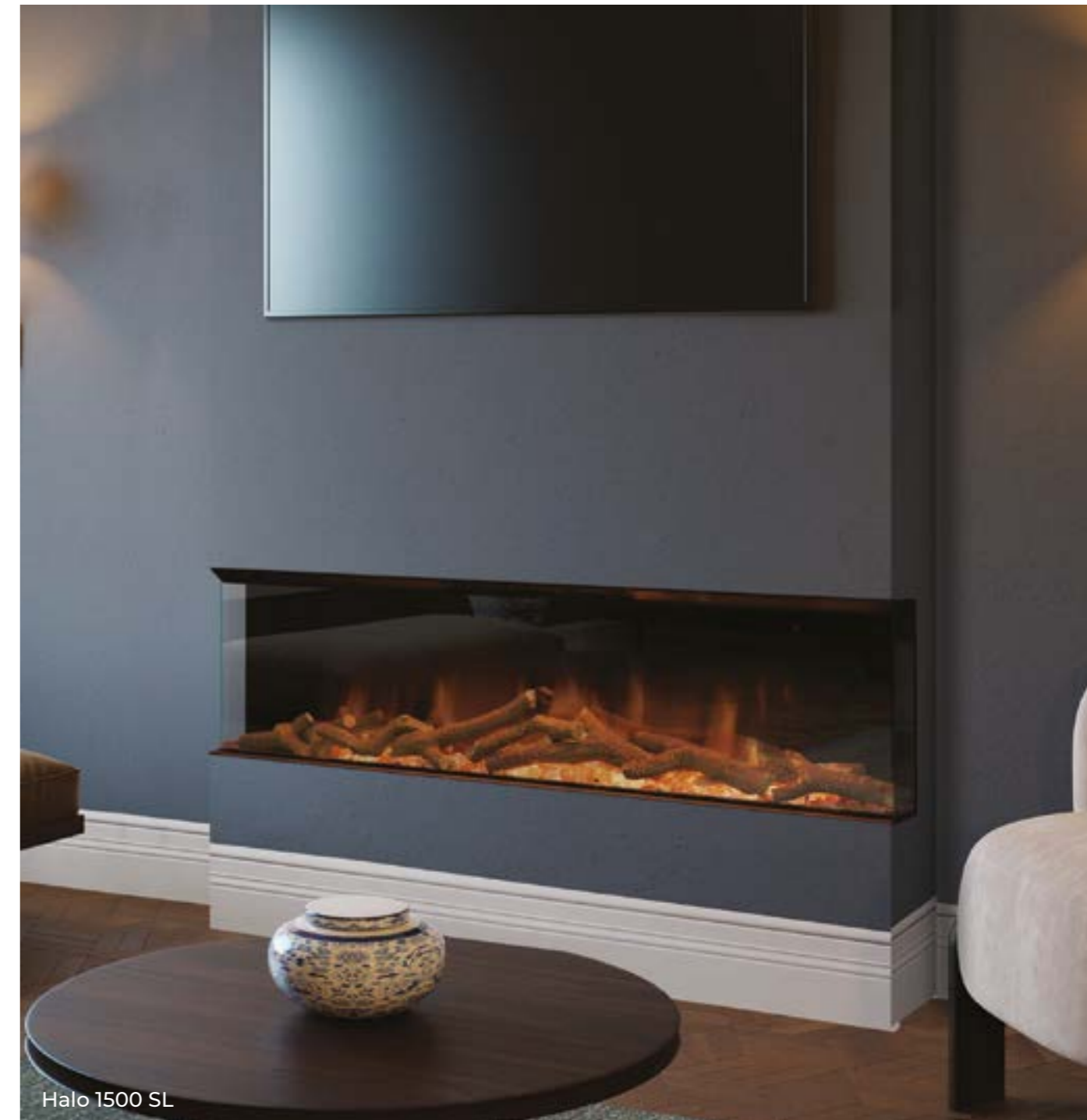
Halo 1500 SL