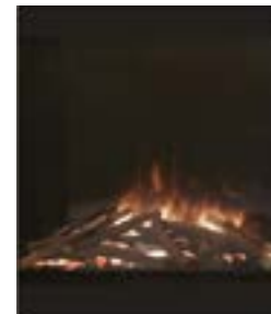
750 | Halo