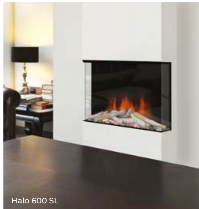
Halo 600 SL