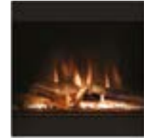
500 | Halo

Our built-in models come in a variety of sizes, across our ranges, allowing you to find the exact fit to create a statement showpiece.