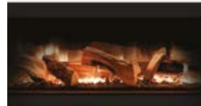
1030 | Halo, E-series, E-lectra and Volante