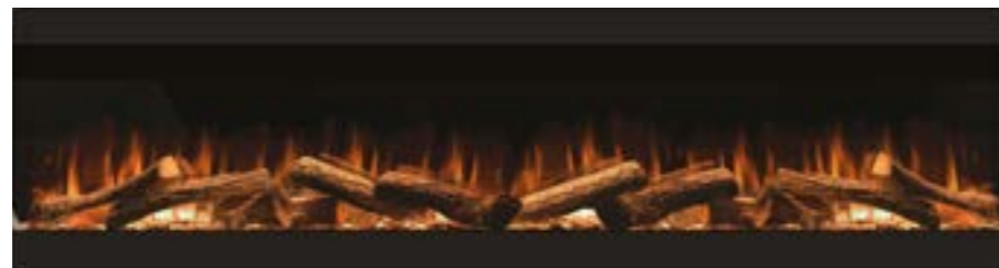
2400 | Halo