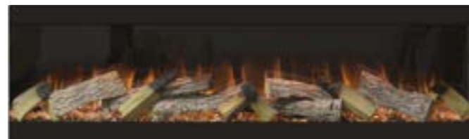
1800 | Halo, E-series, E-lectra and Volante